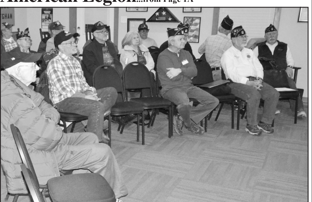
American Legion Post 121 is excited for what 2020 will bring, and its members continue to look forward to advocating for veterans in the community. program at the Georgia National